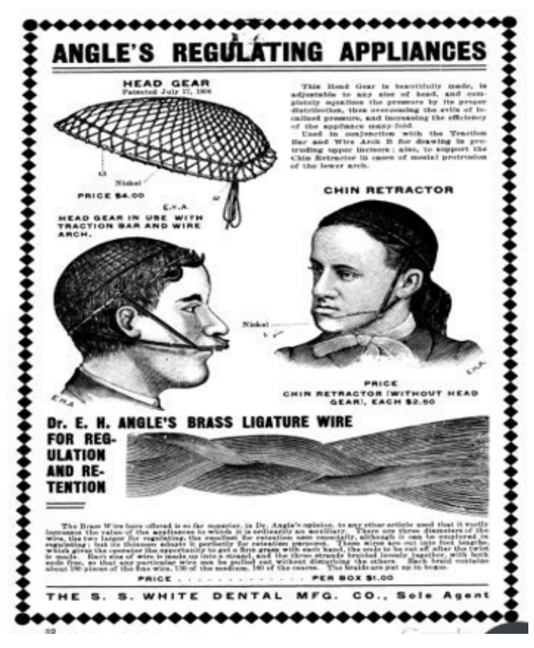
Illustration from Dental Cosmos (1903).

After 119 years, we return to beautiful Asheville in the fall, a color-filled time to experience the wonderful autumn and attend an exciting meeting. The presentations will address issues that concern our state and territory boards.